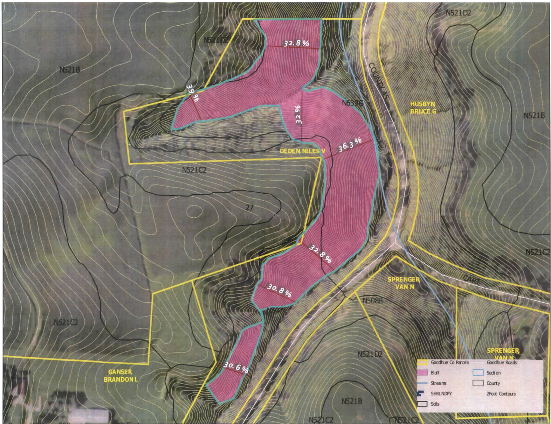
Deden Bluff Review Sec 27 Hay Creek